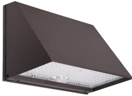
20W / 40W / 60W